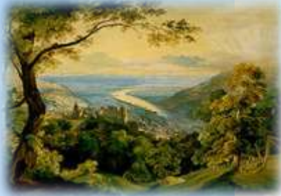
Heidelberg - Carl Rottmann, 1815

Heidelberg's old town, the castle – you will find history at every turn. The city that is home to Germany's oldest university (established in 1386) looks back on 800 years of history. During this time, the city has attracted poets like Goethe, Eichen-dorff and Mark Twain, famous artists like Turner, Fohr and Trübner were inspired by its colorful impressions, and composers like Brahms, Schumann and Carl Maria von Weber translated the