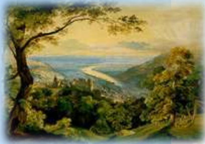
Heidelberg - Carl Rottmann, 1815

Heidelberg's old town, the castle – you will find history at every turn. The city that is home to Germany's oldest university (established in 1386) looks back on 800 years of history. During this time, the city has attracted poets like Goethe, Eichen-dorff and Mark Twain, famous artists like Turner, Fohr and Trübner were inspired by its colorful impressions, and composers like Brahms, Schumann and Carl Maria von Weber translated the